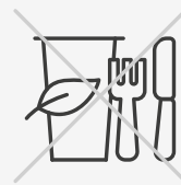
Biodegradables & compostables